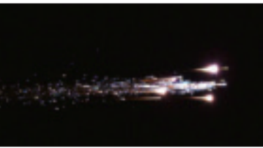
The Hayabusa capsule, which returned to Earth after a seven-year journey to asteroid Itokawa, is seen on the right, leading the debris and disintegration of the spacecraft.

In February, a challenging mission to the Moon was cleared for mission implementation. NASA approved sending two of the outer THEMIS (time history of events and macroscale interactions during substorms) probes into lunar orbits to make measurements of the lunar wake, magnetotail, and solar wind through 2012. This new mission is named ARTEMIS (acceleration, reconnection, turbulence, and electrodynamics of Moon interaction with the Sun), and implementation was carried out in collaboration with University of California-Berkeley, JPL, and NASA Goddard. ARTEMIS is the first mission to consider placing an Earth-orbiting constellation into a lunar constellation.