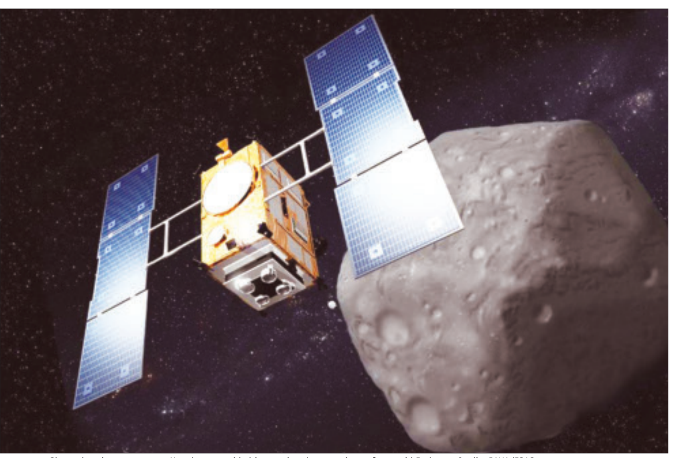
Sharp-shooting cameras on Hayabusa provided impressive close-up views of asteroid Itokawa.

fectionately known as "Dr. Rocket" in Japan, he had played a seminal role in the early stages of the country's space program.