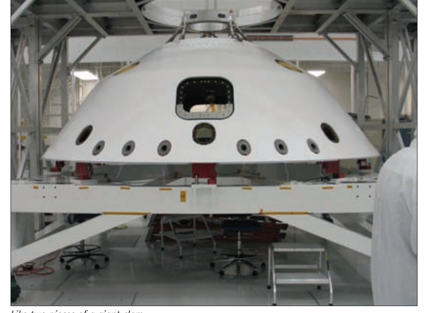
Like two pieces of a giant clam, the aeroshell's backshell (above) and heat shield (below) come together to protect the rover and the propulsion stage that safely delivers it to the surface of Mars.

therein lies a tale of too much mission and not enough time—or money.