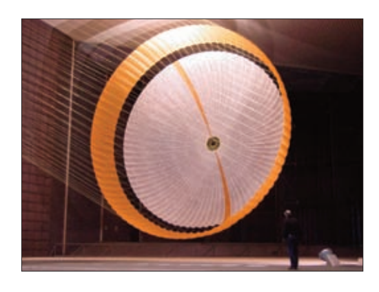
The team developing the landing system tested the deployment of an early parachute design in mid-October 2007 inside the world's largest wind tunnel, at NASA Ames.

ments," he adds. The design of the gears was shifted from steel gears to titanium because of the desire to reduce weight and mass. "It was much lighter. But the dry film on the titanium [gears] didn't work—the titanium gears were unable to hold the stress," says McCuistion. Dry film would not stay on the gears, or adhere to the metal. NASA then made the decision to change back to a steel gear designand with it, wet lubricants.