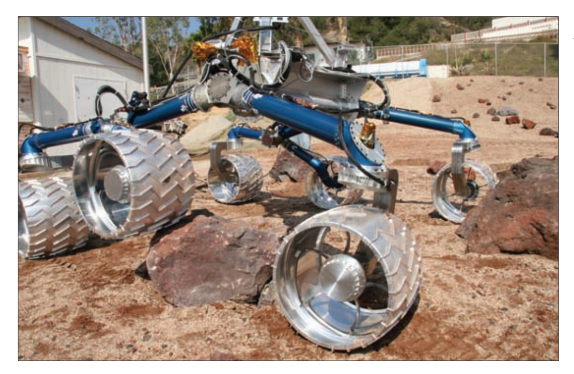
Engineers took the MSL rover for a test drive in the lab. The "Scarecrow" engineering model, so named because it was still missing its computer brain, easily traversed large rocks in JPL's "Mars Yard."

front mobility system will be deployed so that it is essentially ready to rove upon landing.