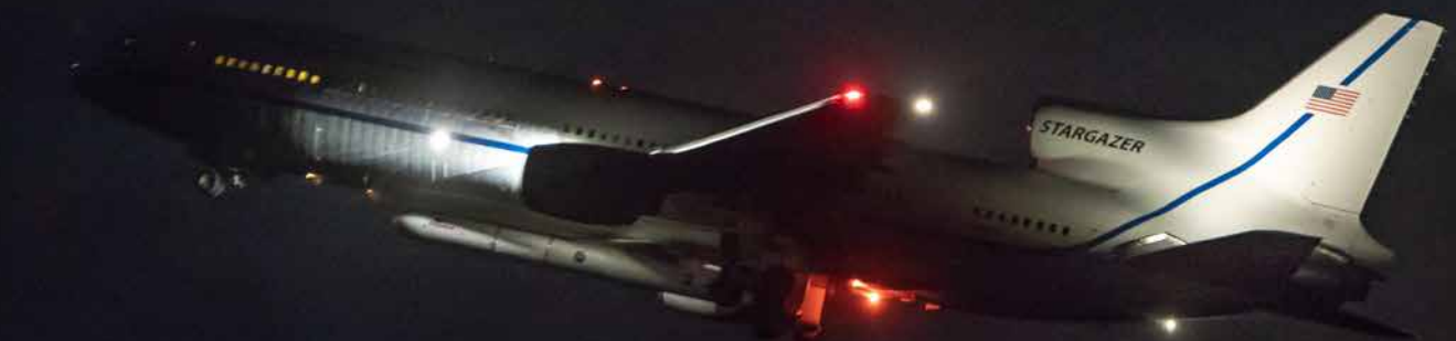
Northrop Grumman's L-1011 Stargazer aircraft, with the company's Pegasus XL rocket attached beneath, takes off from the Skid Strip runway at Cape Canaveral Air Force Station in Florida on Oct. 10, 2019. NASA's Ionospheric Connection Explorer (ICON) is secured inside the rocket's payload fairing. The air-launched Pegasus XL was released from the aircraft at 9:59 p.m. EDT to start ICON's journey to space.

The region of space where ICON will conduct its study – the ionosphere – comprises of winds that are influenced by many different factors: Earth's seasons, the heating and cooling that takes place throughout the day, and bursts of radiation from the Sun.