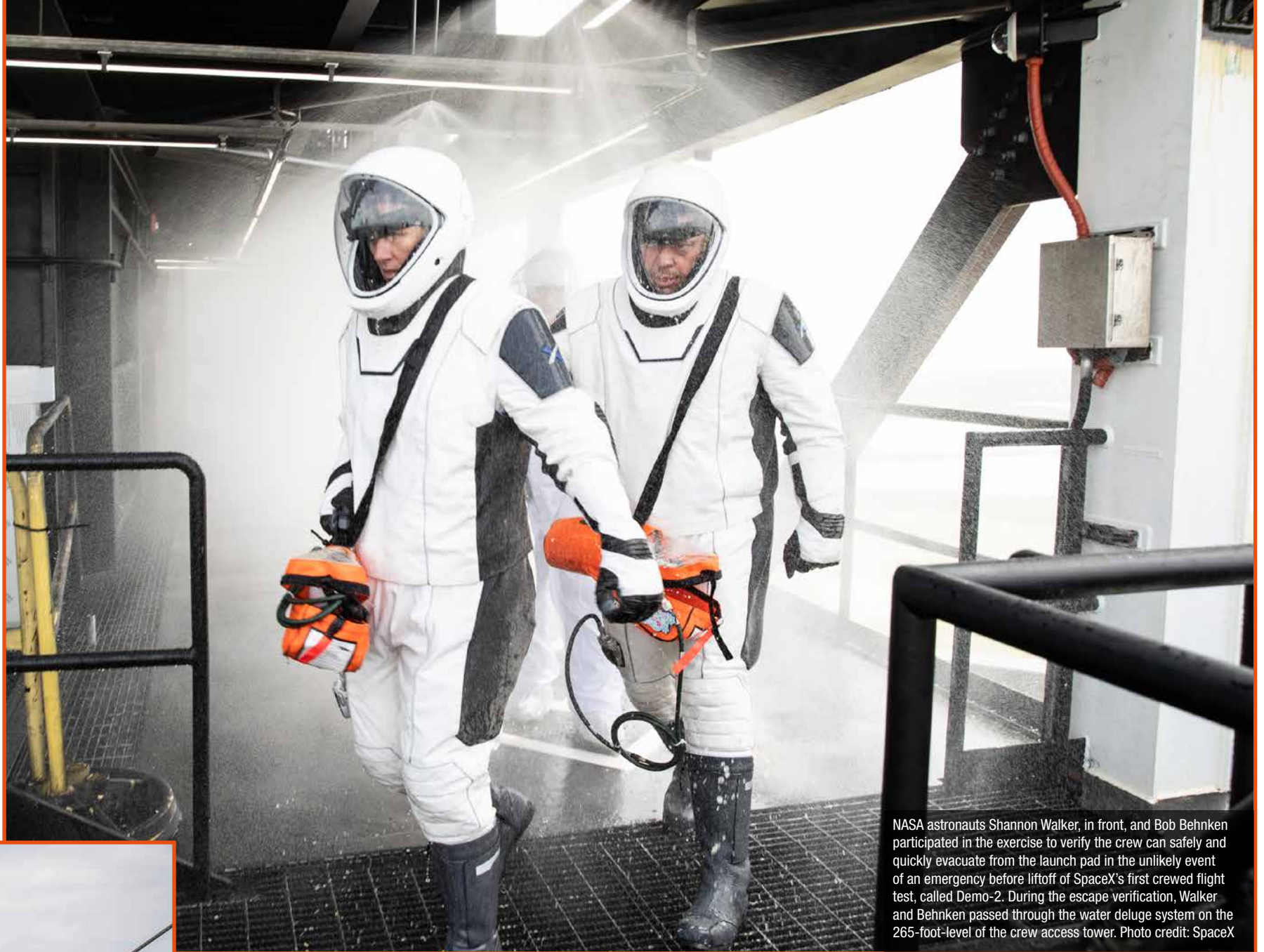
NASA astronauts Shannon Walker, in front, and Bob Behnken participated in the exercise to verify the crew can safely and quickly evacuate from the launch pad in the unlikely event of an emergency before liftoff of SpaceX's first crewed flight test, called Demo-2. During the escape verification, Walker and Behnken passed through the water deluge system on the 265-foot-level of the crew access tower.

SpaceX provided a demonstration of activating alarms and beacons, putting on emergency breathing air bottles and activating the water deluge system on the crew access level, followed by