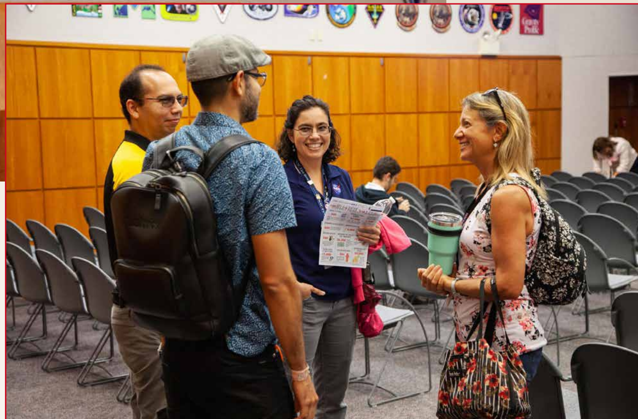
Kennedy Space Center workers mingle before a Hispanic Heritage Month presentation in the Neil Armstrong Operations and Checkout Building Mission Briefing Room on Oct. 10, 2019.