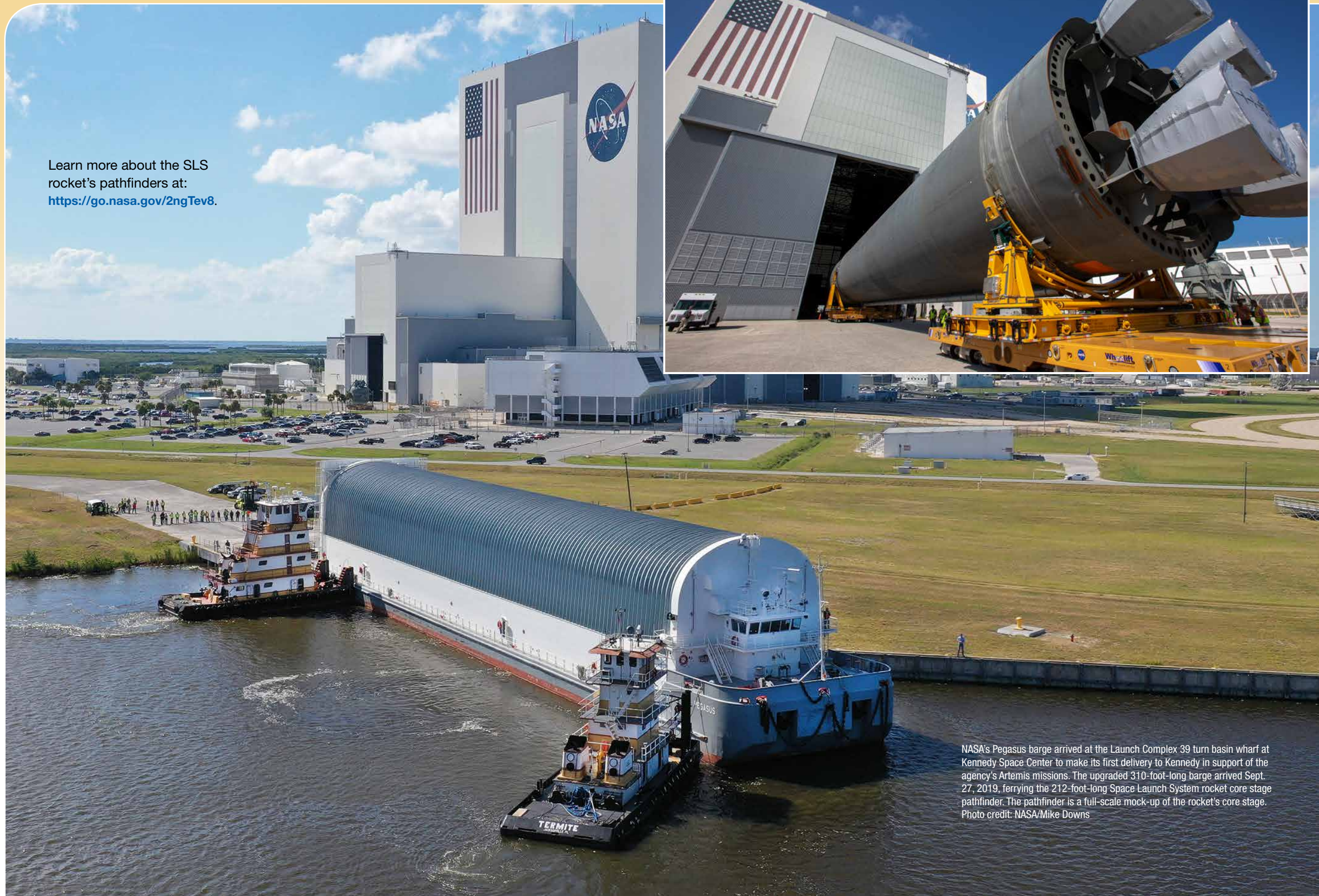
NASA's Pegasus barge arrived at the Launch Complex 39 turn basin wharf at Kennedy Space Center to make its first delivery to Kennedy in support of the agency's Artemis missions. The upgraded 310-foot-long barge arrived Sept. 27, 2019, ferrying the 212-foot-long Space Launch System rocket core stage pathfinder. The pathfinder is a full-scale mock-up of the rocket's core stage.

The 212-foot-long Space Launch System rocket core stage pathfinder is moved into the low bay of the Vehicle Assembly Building at NASA's Kennedy Space Center on Oct. 1, 2019. NASA's Pegasus barge arrived at the Launch Complex 39 turn basin wharf on Sept. 30, 2019, making its first delivery to Kennedy in support of the agency's Artemis missions.