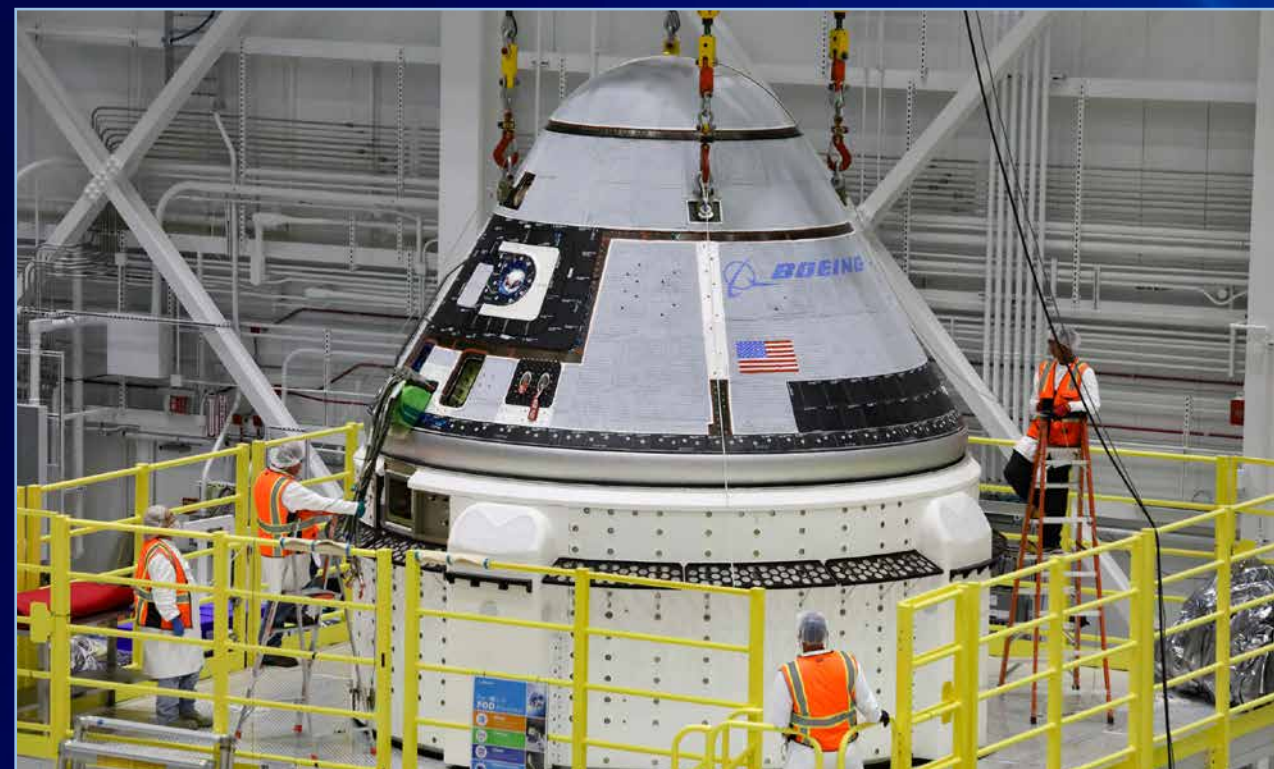
The crew module of Boeing's CST-100 Starliner spacecraft is lifted onto its service module on Oct. 16, 2019, inside the Commercial Crew and Cargo Processing Facility (C3PF) at NASA's Kennedy Space Center ahead of the company's Orbital Flight Test to the International Space Station as part of the agency's Commercial Crew Program.