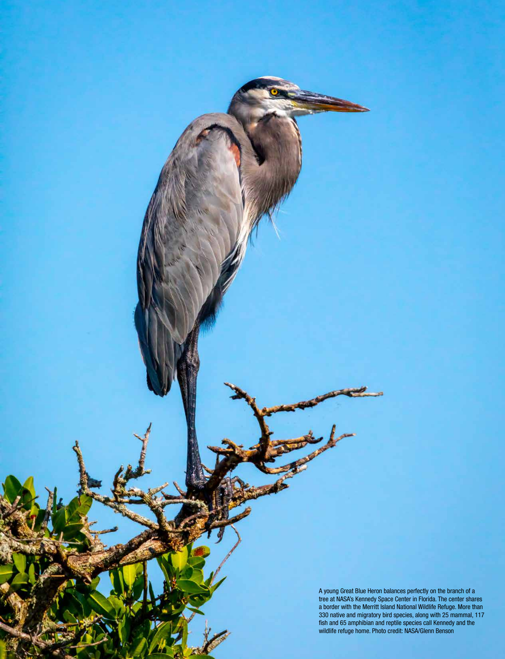
A young Great Blue Heron balances perfectly on the branch of a tree at NASA's Kennedy Space Center in Florida. The center shares a border with the Merritt Island National Wildlife Refuge. More than 330 native and migratory bird species, along with 25 mammal, 117 fish and 65 amphibian and reptile species call Kennedy and the wildlife refuge home.