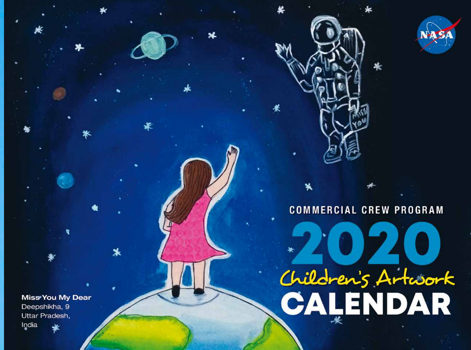
Miss You My Dear Deepshikha, 9 Uttar Pradesh, India

The Commercial Crew Program is holding an artwork contest now that ends Nov. 4 for children ages four to 12 years old. The winning artwork will be used to create a 2020 calendar, which has a different space-related theme for each month. The themes educate students about the International Space Station, astronauts, growing food in space and more! Unique and original artwork will be selected for each month. The calendar also will include supplemental education materials for kids here on Earth to learn more about the space-related themes.