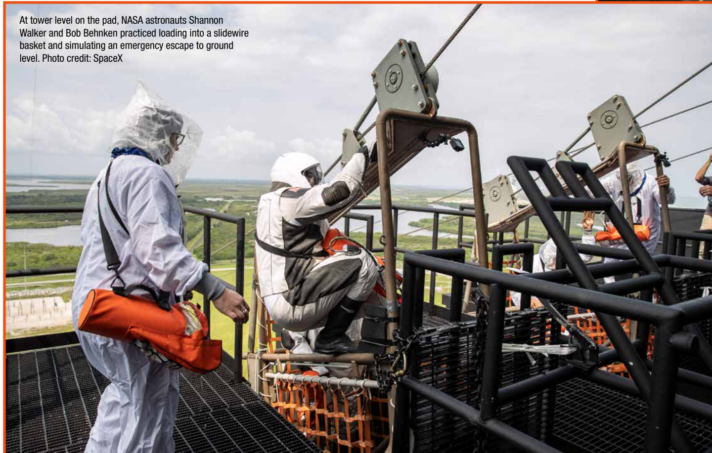
At tower level on the pad, NASA astronauts Shannon Walker and Bob Behnken practiced loading into a slidewire basket and simulating an emergency escape to ground level.

egress from the white room. The astronauts also practiced loading into the baskets. The release mechanisms were also tested, and a weighted empty basket was sent down the length of the slidewire cable to the landing area.