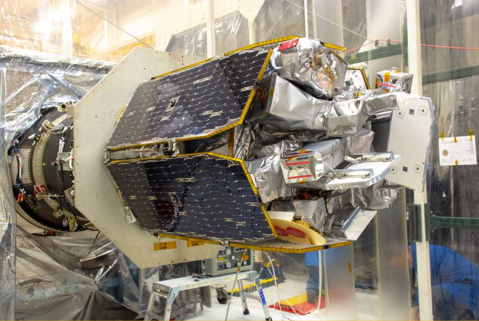
Left: NASA's Ionospheric Connection Explorer (ICON) was attached to the Northrop Grumman Pegasus XL rocket inside Building 1555 at Vandenberg Air Force Base in California on Sept. 10, 2019.

This region also is where radio communications and GPS signals travel, and fluctuations within the ionosphere can cause significant disruptions to these critical technologies.