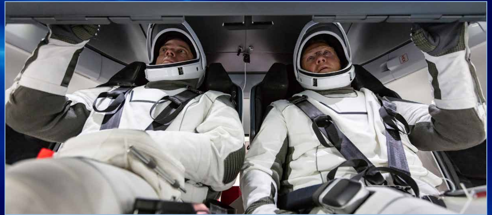
NASA astronauts Doug Hurley and Bob Behnken familiarize themselves with SpaceX's Crew Dragon, the spacecraft that will transport them to the International Space Station as part of NASA's Commercial Crew Program. Their upcoming flight test is known as Demo-2, short for Demonstration Mission 2.

For more information on the full suite of NextGen STEM educational resources, visit: https://www.nasa.gov/stem/nextgenstem/index.html .