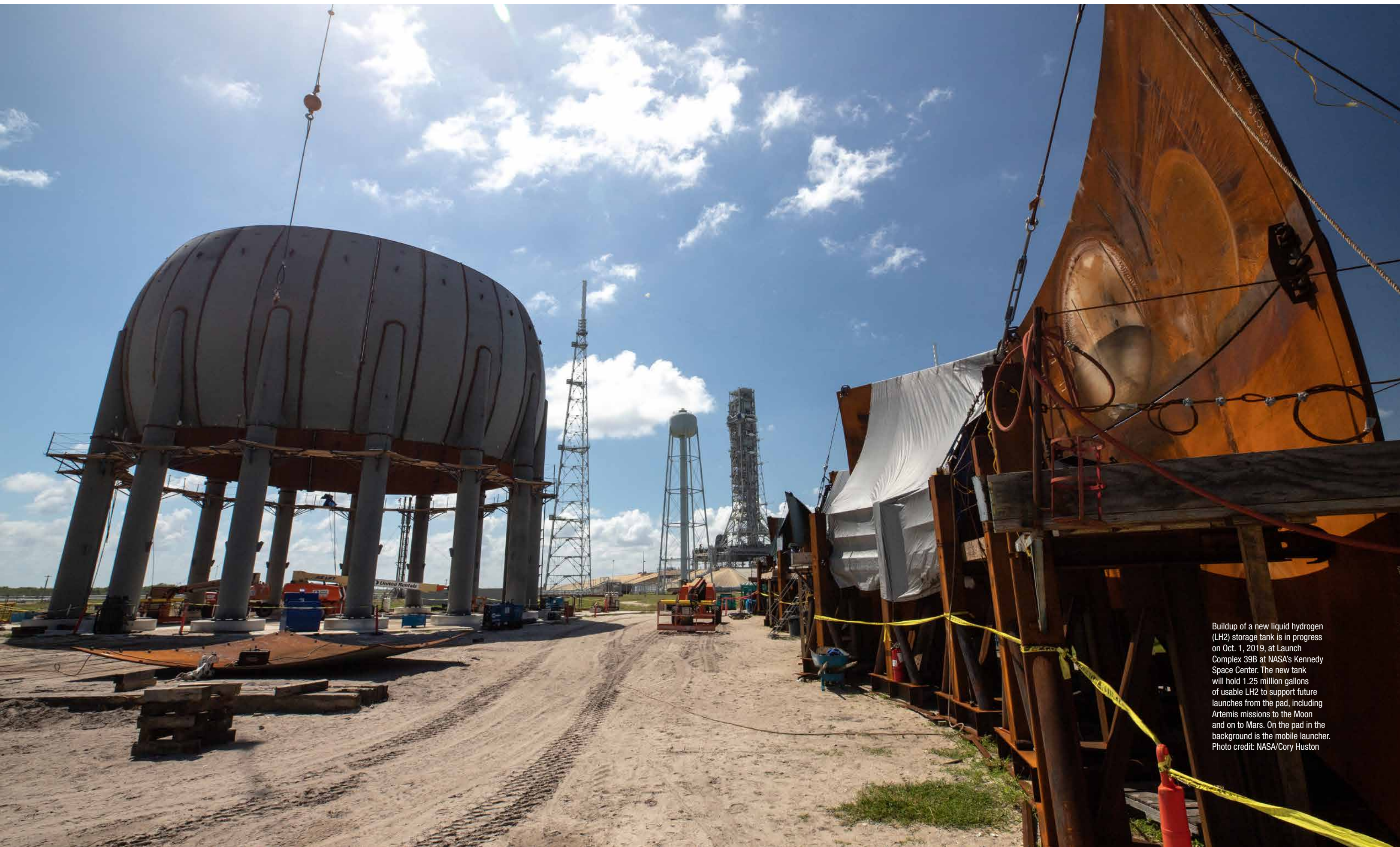
Buildup of a new liquid hydrogen (LH2) storage tank is in progress on Oct. 1, 2019, at Launch Complex 39B at NASA's Kennedy Space Center. The new tank will hold 1.25 million gallons of usable LH2 to support future launches from the pad, including Artemis missions to the Moon and on to Mars. On the pad in the background is the mobile launcher.