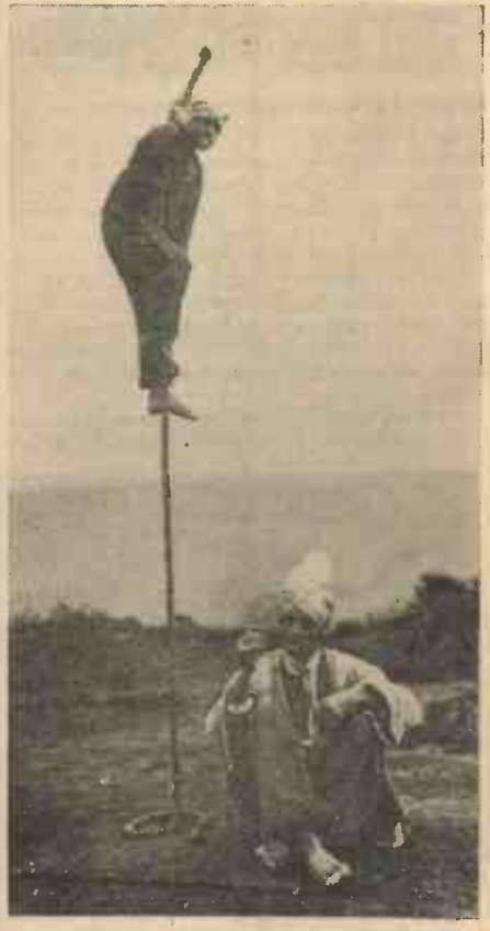
Showing a youth climbing the rigid rope.

AVAST scheme for the improvement of aviation in India has recently been put in hand, one feature being the erection of beacons every hundred miles along a 3,000-mile route from Karachi, in Sind, to Vietoria Point, in Burma.