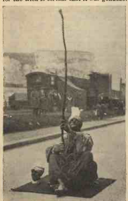
The Indian rope trick being performed on Roborough Down, Devonport.

To most people the Indian rope trick is considered a myth, one explanation being that it is carried out by means of mass hypnotism, during which the audience imagine they see a youth climb up a rope which apparently stands up on end. Others suggest that it is performed with a specially prepared rope, but it is difficult to decide whether either explanation is correct. The pictures on this page show the trick actually being performed at Devonport, and the photographer who examined the rope used for the trick is certain that it was genuine.