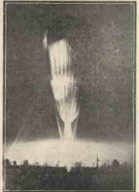
The start of Professor Piccard's ascent at 5 o'clock in the morning.

On the medium waves the effect is about equally balanced. Another important point is that the effect is most marked at night. Long-wave transmissions are thrown sharply back, thus causing a zone of strong reception near to the transmitter, while shorter waves are reflected