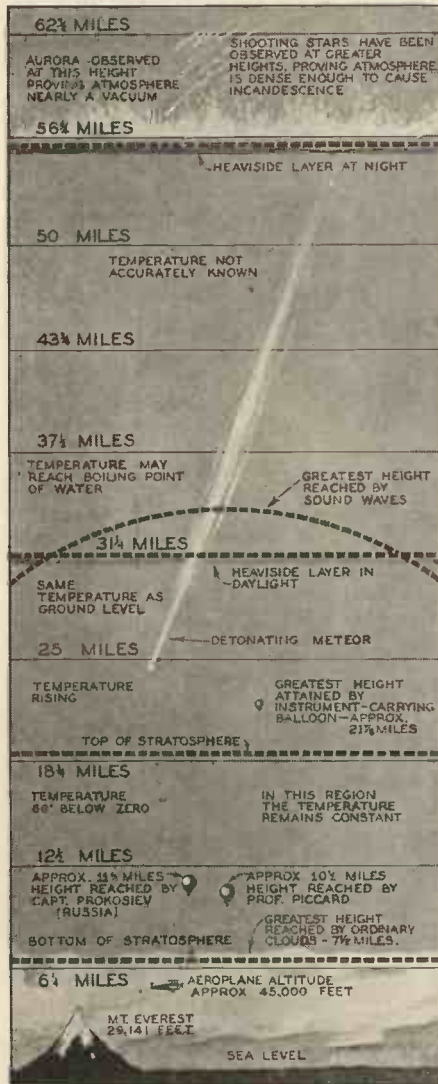
Diagram illustrating the various details of the belts surrounding the earth.

At one end we have the cosmic, gamma, X-ray, and ultra-violet, with wavelengths of .0001 millimeter and below. We then come to the violet, blue, blue-green, green, yellow-green, yellow, orange, and red, which comprise the visible colour spectrum with wavelengths of .00043 millimeters to .000644 millimeters, and finally to the infra-red and radio with wavelengths of .00077 millimeters and upwards. The effect of some of these rays was first discovered by Herschel, and the scientific world now relies upon those whose urge it is to explore the stratosphere to complete our knowledge of this fascinating subject.