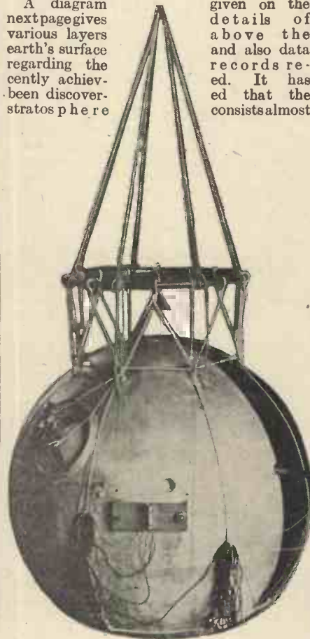
The gondola of the balloon in which Professor Piccard made his memorable ascent into the stratosphere.

given on the details of above the and also data records recorded. It has been ascertained that the consists almost