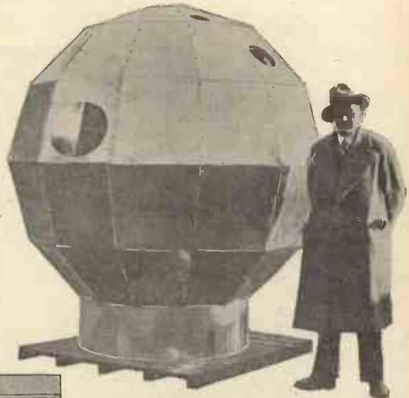
The Austrian stratosphere ascent. The special prismatic gondola is shown here.

The deductions which can be made from these stratospheric ascents are certainly fascinating; everyone knows that the earth resembles a magnet, and like a magnet it has a north and south pole. Correspondingly, there will be the usual magnetic field and the corollary magnetic lines of force extending from the north to the south. If we agree that the ionosphere and the ozonosphere