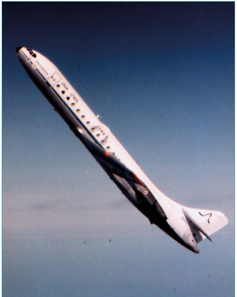
Figure 1. Parabolic flight in a Caravel in France in 1991, during which we measured central venous pressure invasively in eight subjects during short periods (20 s) of weightlessness (Videbaek and Norsk, 1997). The aircraft followed a Keplerian trajectory, whereby a free-fall condition (0 G) was created symmetrically around the top. The 0 G phase was preceded by 20 seconds of pulling up to 2 G and then again followed by an up to 2 G descending phase of similar duration.

According to Starling's law of the heart (Patterson and Starling, 1914) an increase in cardiac preload induces an increase in stroke volume and thus cardiac output, a phenomenon that also occurs in space. We observed in an investigation on the Space Shuttle in 2003 an increase in stroke volume and cardiac output of 22% (Norsk et al. , 2006) a week into the flight. Later on the International Space Station, we found even more pronounced increases of 35 – 41%