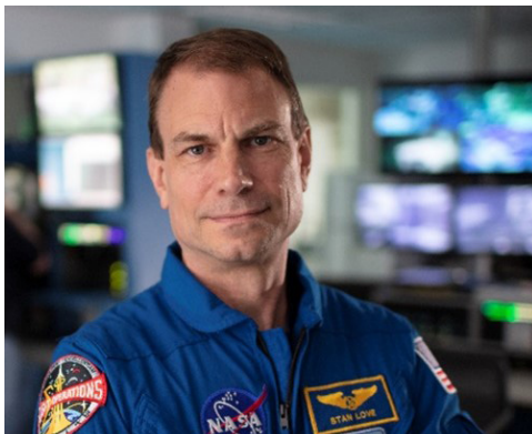
Stan Love Lead Capsule Communicator