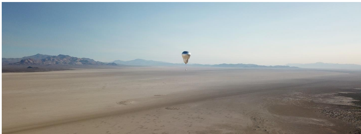
Figure 1: Prototype one-third-scale Venus aerobot in flight above the Blackrock desert, Nevada. The aerobot includes a metallized-Teflon outer envelope and an internal helium reservoir.

Objective: The objective of this work is to develop the variable-altitude Venus technology for a competed-mission aerobot [6], see accompanying Phantom abstract [7]. The architecture consists of two balloons: an outer, metallized Teflon-coated unpressurized balloon (which protects against sulfuric acid aerosols and sunlight), and an inner Vectran-reinforced pressurized balloon that serves as a helium reservoir. Transferring helium between the inner and outer balloons modulates the buoyancy and altitude. For Venus, an aerobot of 12–15 m diameter [8] is necessary for a carrying capacity of 100–200 kg, consistent with a major scientific investigation of and from the cloud layer, with a 10 km-wide altitude-control capability nominally from 52 km to 62 km.