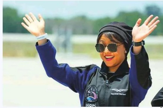
■ Saudi Arabian astronaut Rayyanah Barnawi waves to family and friends as she arrives at the Kennedy Space Centre.