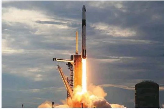
■ The SpaceX Falcon 9 rocket lifts off in Cape Canaveral with the Axiom-2 team of two Saudi and two US astronauts.