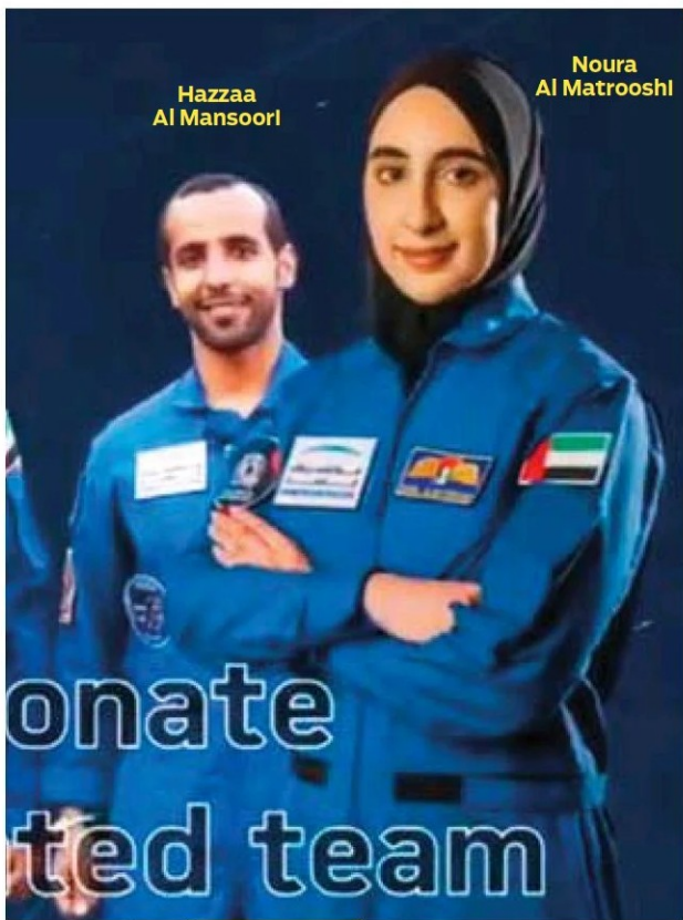
Hazzaa Al Mansoori