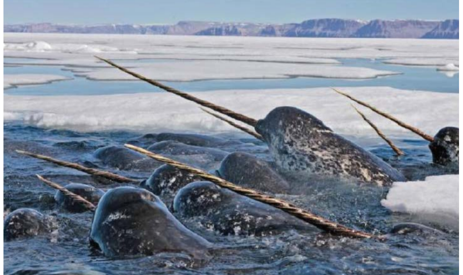
A narwhal's iconic spiral tusk can be used to trace the animal's environment and food supply throughout its life.

A s the Arctic continues to warm, climate changes cascade into the marine environment. Top predators like polar bears, beluga whales, and narwhals are affected by shifting seasonality and loss of the Arctic sea ice that shapes where they live and what they eat. Moreover, changes in ocean currents alter the transport of toxins like mercury through Arctic waters, which can create health concerns for top consumers in marine food webs.