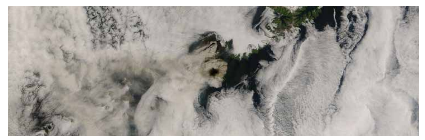
The 2008 Okmok eruption in Alaska resulted in a new volcanic cone, as well as consistent erosion of that cone's flanks over subsequent years. The volcano's ring-shaped plume is visible in the center of this satellite image. Credit: NASA image courtesy of Jeff Schmaltz, MODIS Rapid Response Team, NASA Goddard Space Flight Center

In this map of ArcticDEM coverage, warmer colors indicate more overlapping data sets available for time series construction. Blue and red rectangles mark mass wasting events, triangles identify volcanoes, and red stars show locations of active layer detachments and retrogressive thaw slumps, both used for studying landslides. Credit: Chunli Dai