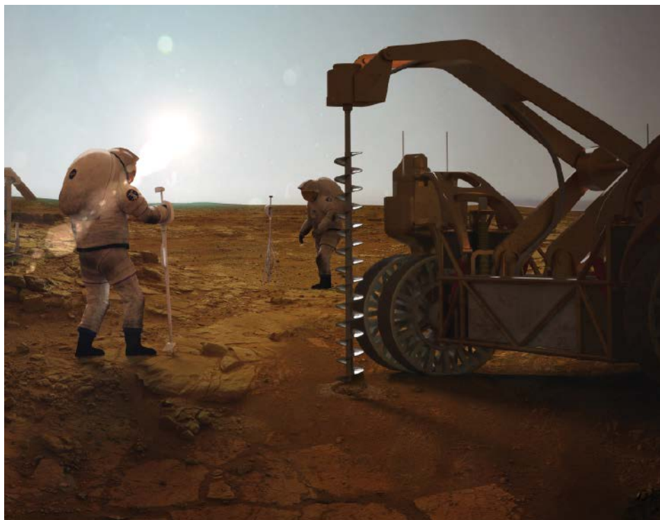
Explorers on Mars extract water from subsurface ice deposits in this artist's rendering.

So far, exploration of Mars has been carried out by robotic explorers, which have