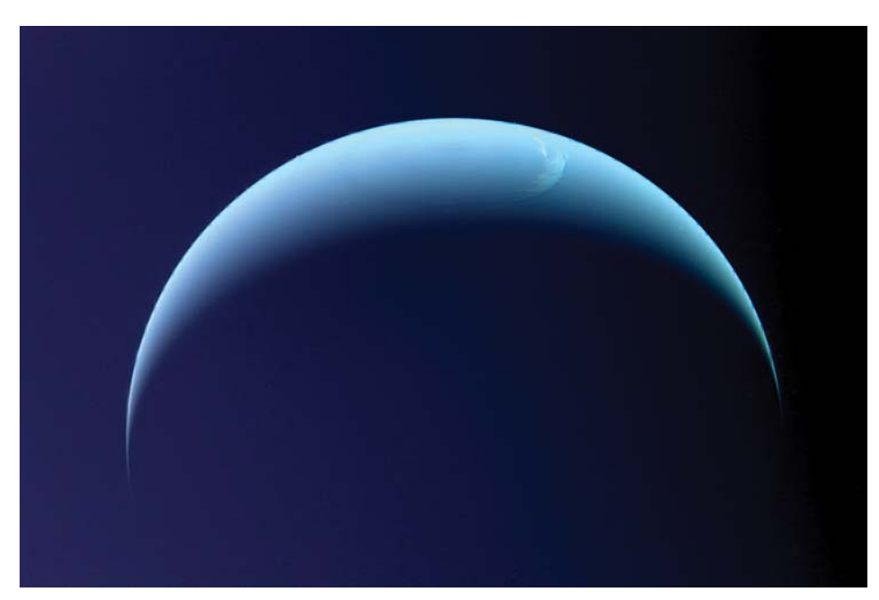
NASA's Voyager 2 snapped this picture of a crescent Neptune on 31 August 1989 during the spacecraft's flyby of the planet. Voyager 2 is the only mission to have visited Uranus or Neptune.

aunching a small orbiter with an accompanying atmospheric probe to the solar system's ice giants, Uranus and Neptune, should be a top priority for NASA in the coming decade, say planetary scientists who conducted a review of potential missions to do so. Beyond being scientifically valuable, such a mission to each planet is technologically feasible, the team said. Voyager 2 visited the ice giants in the 1980s, the only craft ever to do so.