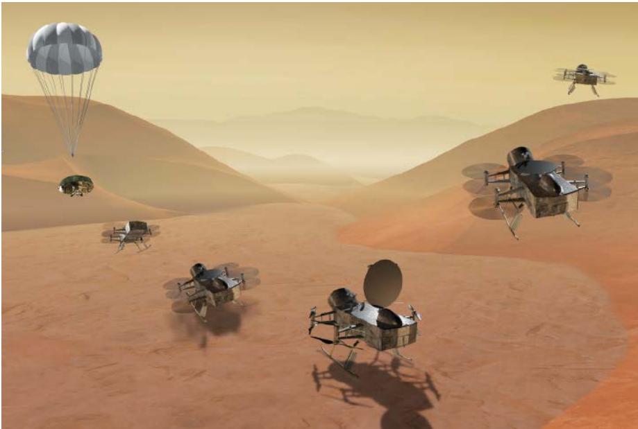
NASA's upcoming Dragonfly mission (artist impression) will land on the surface of Saturn's moon Titan, which has a subsurface liquid water ocean.