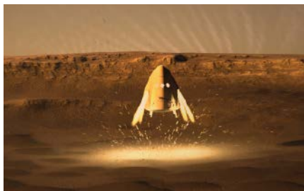
A commercially built capsule, the SpaceX Dragon, lands on Mars in this artist’s rendering.