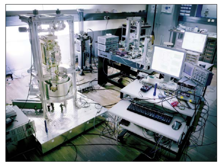
The new definition of the kilogram lends itself to measurements using a Kibble balance (at left) and an absolute gravimeter (in the background, with the black tripod and the transparent, cylindric dropping chamber), like these instruments at the Federal Institute of Metrology (METAS) in Switzerland.

(<sup>28</sup>Si) single-crystal sphere using the X-ray crystal density approach. This is also known as the Avogadro experiment because it was originally used to yield an accurate value for Avogadro's constant, the number of carbon-12 atoms that amass to exactly 12 grams. (Avogadro's number of hydrogen atoms, the lightest element, would weigh 1 gram, but carbon is much easier to weigh than hydrogen.)