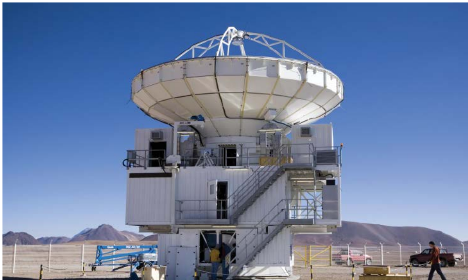
The Atacama Pathfinder Experiment (APEX) 12-meter telescope in Chile’s Atacama Desert, shown here, will join others to image the immediate surroundings of a black hole in April.

A worldwide collaboration of radio astronomers called the Event Horizon Telescope (EHT) is taking a close look at the atmosphere here on Earth to get a better view of an elusive area of deep space. Thanks to the astronomers’ recent modeling of the past 10 years of global atmospheric and weather data, they can now predict when nine radio telescopes and arrays scattered around the world are most likely to have the clear view they need to make their extraordinary simultaneous observations.