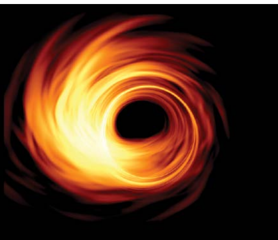
A simulation of light emitted by hot gas as it orbits a black hole, viewed from 45° above the orbital plane, similar to what EHT hopes to see. Brightness indicates the intensity of the emitted radio frequency light. The black hole's intense gravity bends light emitted from inner parts of the accretion disk around its event horizon, creating the black hole silhouette seen in the center.

EHT's nine radio telescopes and arrays at seven observing sites compose the largest VLBI array in the world. Getting onto the observing schedule at any one of the telescopes is competitive, and negotiating for simultaneous observing time on all nine is even more difficult.