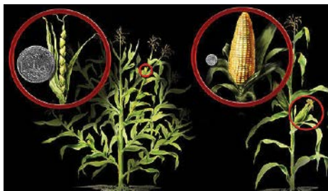
A comparison of teosinte and modern corn.

found at the roots of modern corn. Unexpectedly, the bacterial communities for teosinte and corn were similar.