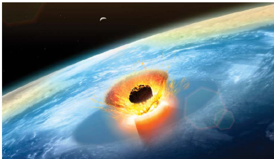
Artist's rendering of an asteroid more than 10 kilometers wide striking Earth about 66 million years ago.

Today, because some areas of the oceans are already showing signs of oxygen depletion, the threat is not as much from off planet as it is from within, Thomas explained. Thus, if temperatures continue to climb in the coming century, humanity seems poised to become its own kind of asteroid.