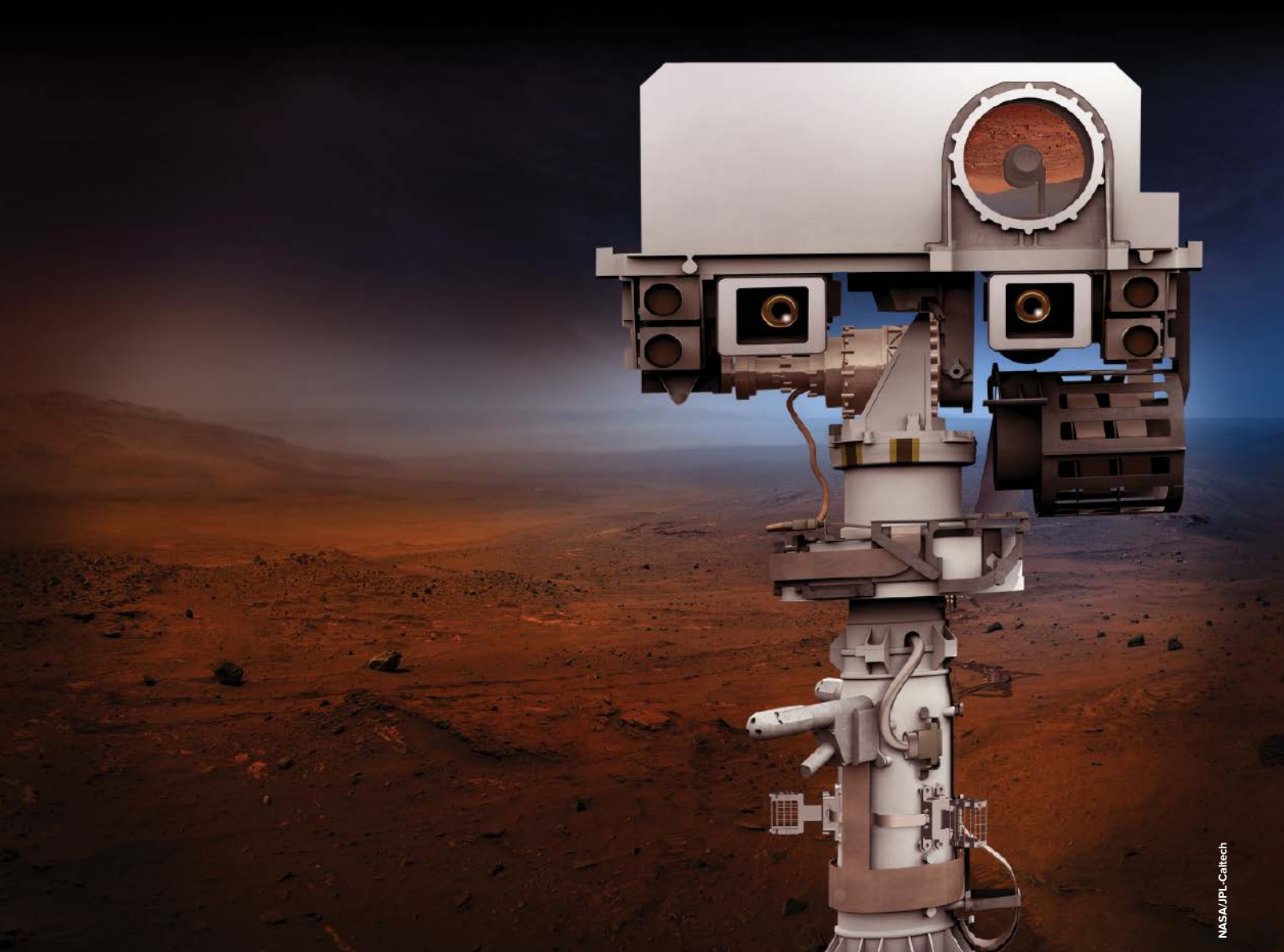
Artist's conception of the instrument mast for NASA's Mars 2020 rover, which will carry out new objectives using the basic engineering of NASA's Mars Science Laboratory/Curiosity.

Mars 2020 (see http://go.nasa.gov/2iMOKW8 ), will be the first to select, collect, and cache a suite of samples from another planet for possible future return to Earth, fulfilling the vision of the most recent planetary science decadal survey to take the first step toward Mars Sample Return [National Research Council, 2011].