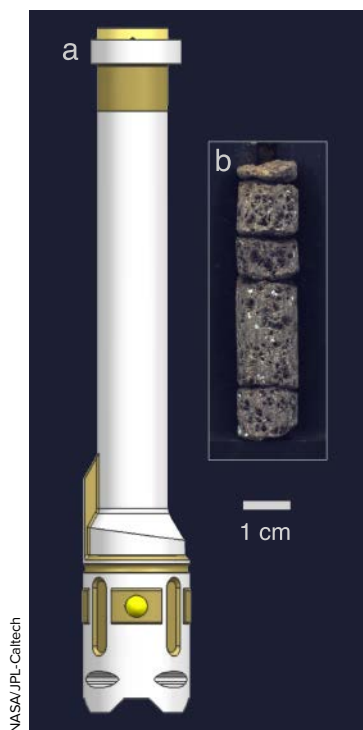
Fig. 2. (a) Illustration of a sample tube. Sample tubes will be coated with titanium nitride (gold color) to limit organic molecule adsorption and with aluminum oxide (white) to reduce solar heating while the tubes are on Mars's surface. The tube is mounted within a rotary-percussive drill bit, and sample core material is introduced directly into the tube through an opening (located at the top in the orientation shown here). Features at the bottom of the tube are used for robotic tube manipulation. (b) Samples are cylindrical cores, typically 7.5 centimeters in length. Samples frequently break into fragments during drilling, as illustrated by this terrestrial basalt test core. Both images are at the scale indicated.

than one viable Earth organism in each of the returned samples.