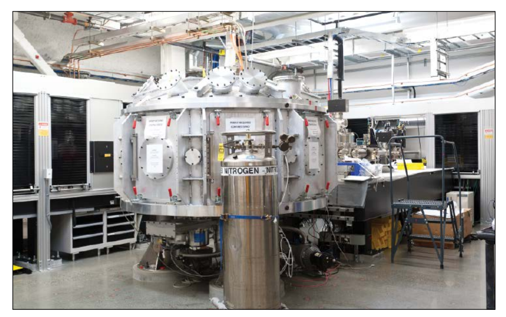
The Matter in Extreme Conditions instrument (central chamber) attached to SLAC National Accelerator Laboratory's Linac Coherent Light Source can replicate the pressures and temperatures found in the interiors of ice giant planets, enabling researchers to observe chemical reactions that may occur under those conditions.

To see diamond formation, the sample needed to be highly compressed but not heated beyond the melting point of diamond, a tricky combination for most laser experiments, Glenzer explained. The lasers compressed the sample for only a few nanoseconds, too short a time to substantially increase the temperature. The team performed its experiment with the Matter in Extreme Conditions (MEC) instrument on SLAC's Linac Coherent Light Source (LCLS).