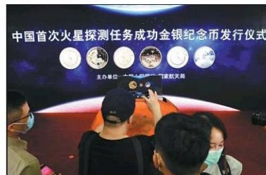
People photograph a set of gold and silver commemorative coins marking the success of China's first Mars mission in Beijing on Monday. The coins were jointly issued by the China National Space Administration and the People's Bank of China.

To mark the mission's achievement, the administration and the People's Bank of China issued a set of gold and silver commemorative coins on Monday.