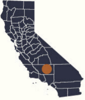
Mojave Air and Space Port, California