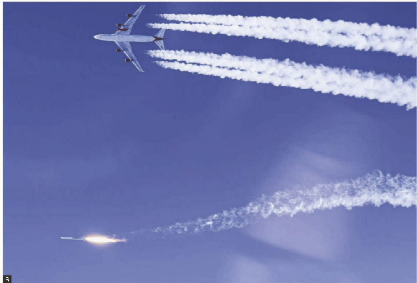
VIRGIN ORBIT X4 3

On the morning of 17 January, Virgin Orbit’s LauncherOne rocket made its first successful voyage into orbit. The rocket was launched from under the wing of a jet aircraft, rather than a traditional launch pad on the ground, from Mojave Air and Space Port in California. It is the first orbital class, air-launched, liquid-fuelled rocket to reach space.