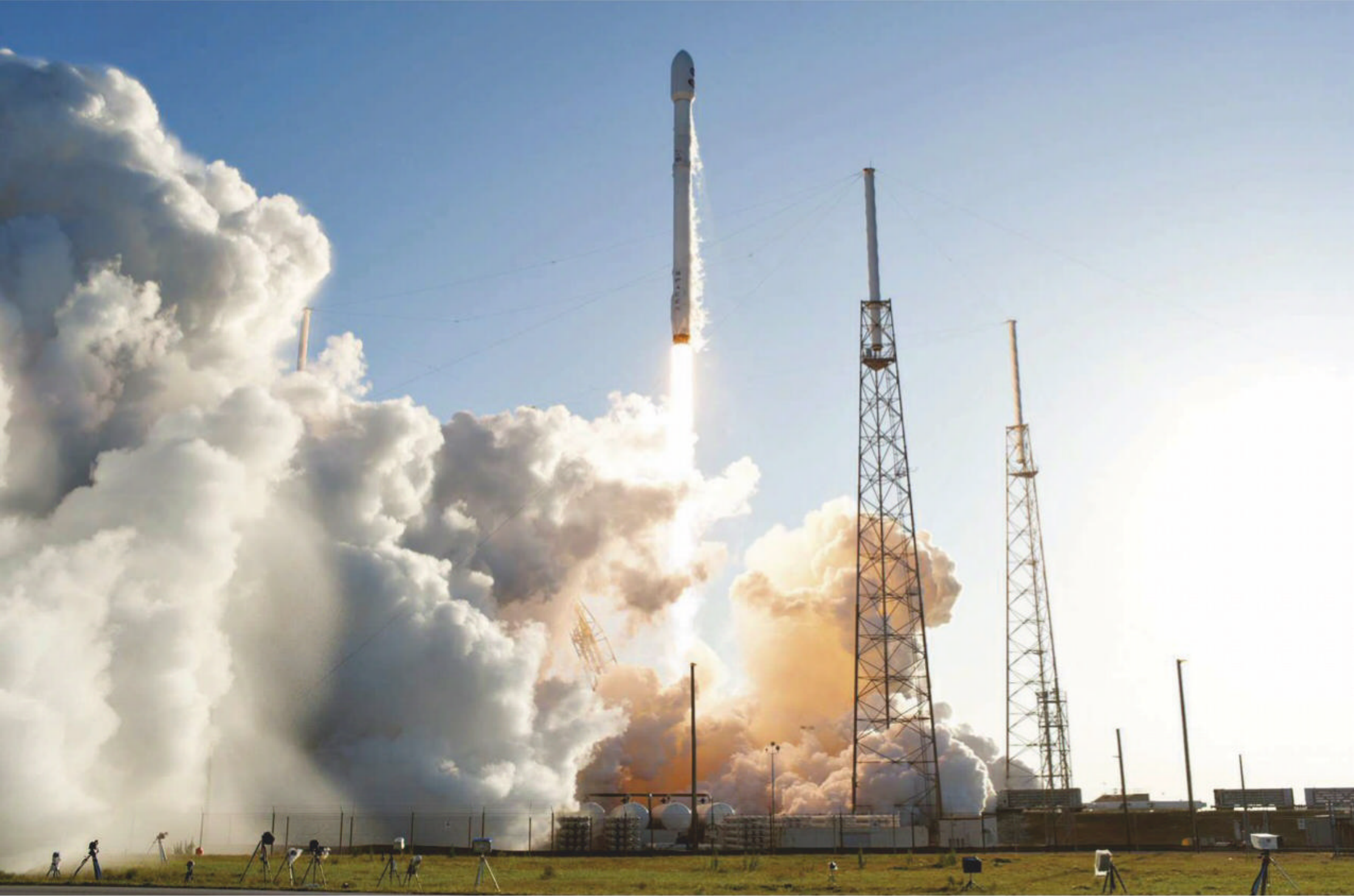
ABOVE NASA's Transiting Exoplanet Survey Satellite (TESS) launches onboard a Falcon 9 rocket at Cape Canaveral, April 2018

guesswork in the TV programmes mentioned previously might not be too wide of the mark – if anything, those visions might be too tame, given the potential for the vast amount of life that might have evolved on very different planets.