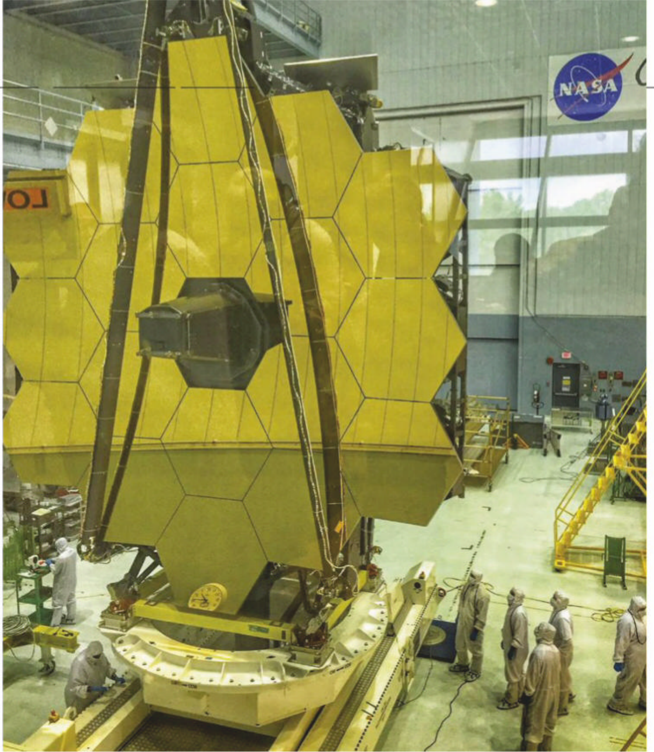
ABOVE Launching in 2021, the James Webb Space Telescope will tell us more about exoplanets, their atmospheres and their potential for hosting life

The seasons could be vastly different, too. Many planets have much shorter orbital periods than the Earth’s 365.25 days, speeding up seasonal changes to weeks or days rather than months. Some planets have more elliptical orbits that would make seasons much more