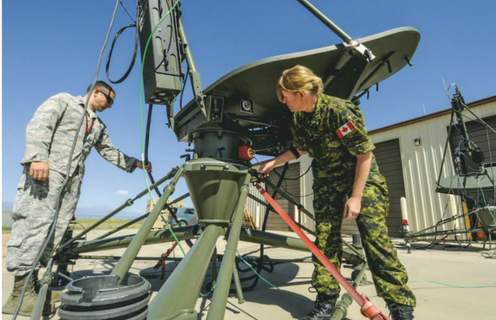
➔ The tools of electronic warfare: Technicians with the 527th set up antennas outside what they call “The Barn” at Schriever Air Force Base.