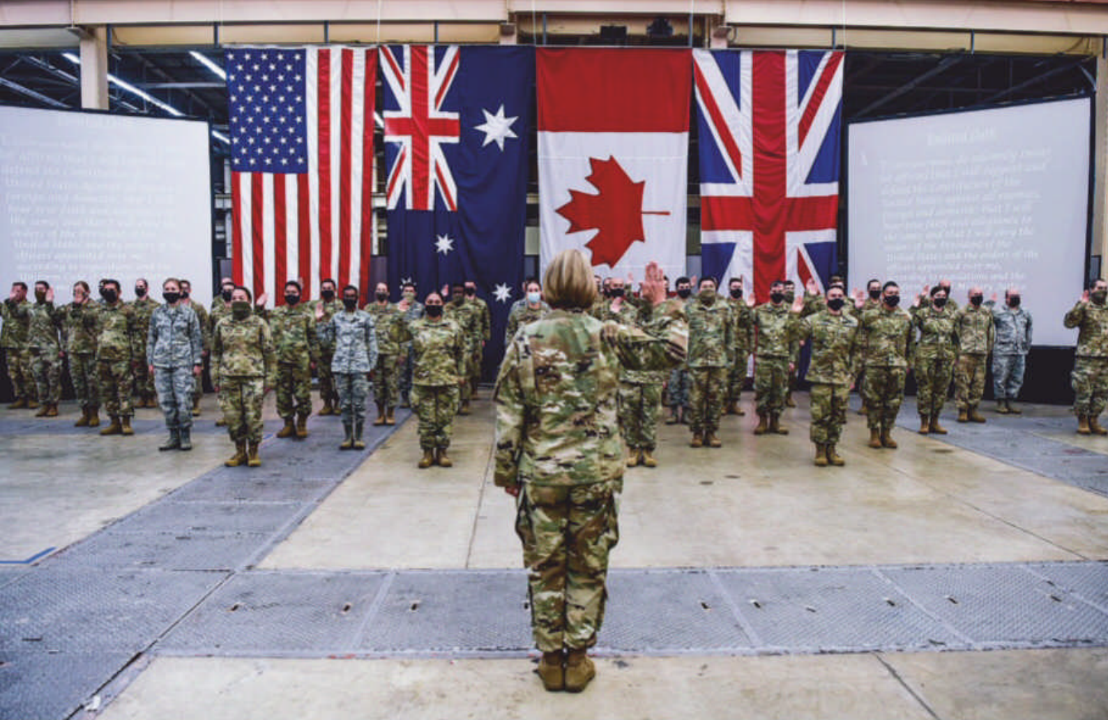
← At Vandenberg Air Force Base last September, new members of the Space Force are sworn in.