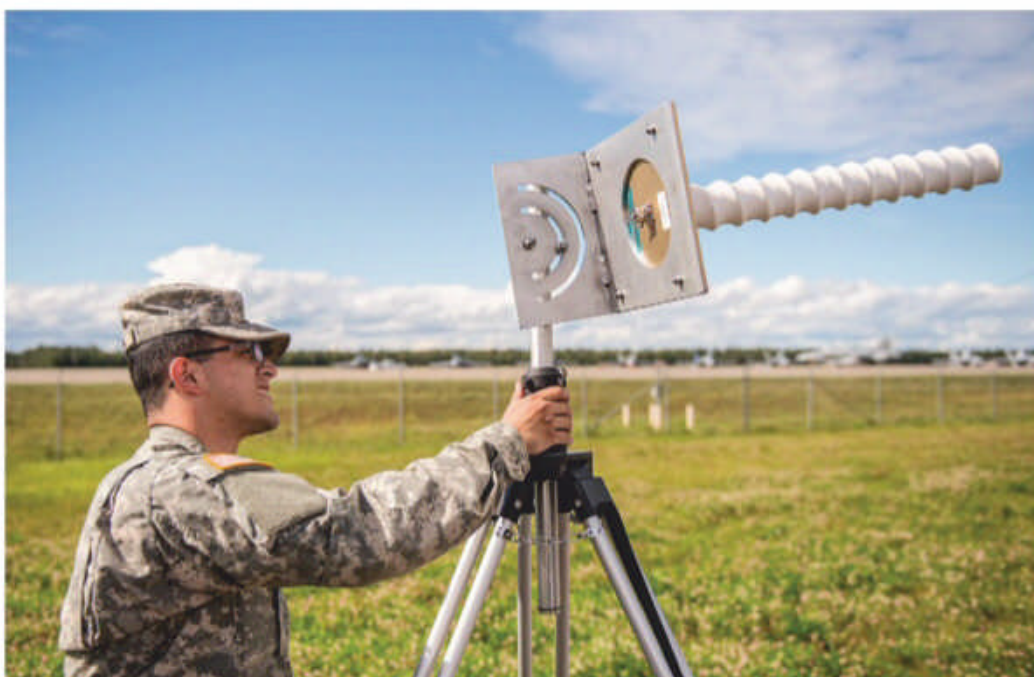
↑ The name and insignia (right) say it all. During training exercises, the 527th Space Aggressors are there to mess you up. Above: A member of the squadron adjusts an antenna during a Red Flag exercise in Alaska in 2016.