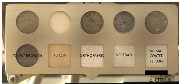
Figure 1: Image taken by the SHERLOC/WATSON camera on the Mars 2020 rover, on Sol 26 of the mission, showing the five space suit materials on Mars.

Introduction: The Mars 2020/“Perseverance” rover carries a suite of space suit materials as part of the SHERLOC* calibration target [1]. The materials are periodically analyzed by SHERLOC as part of a regular calibration routine and are generating a rich data set regarding their degradation in the martian surface environment. The Maximization of Calibration Fabrics (Max-CF) project will effectively turn SHERLOC data into a measure of space suit material service lifetimes by exposing a second set of materials in a Mars chamber, replicating SHERLOC measurements using the analogous ACRONM** instrument at JSC, and then performing materials testing to include tensile testing. These data can be used to inform space suit design and/or materials development, improving crew safety for future Mars missions. This will partially address NASA’s Strategic Knowledge Gap 8 (Mars Surface Technology) which identifies a need to develop technologies to “sustain humans on the surface of Mars [and] enable human mobility and exploration” [2]. This abstract describes the overall Max-CF project and progress on the laboratory-based study to date.